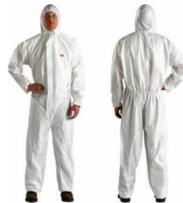
3M Coveralls AKA Moonsuit sizes other than XL