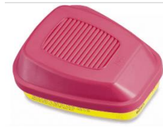
Filter (pair) for Respirators