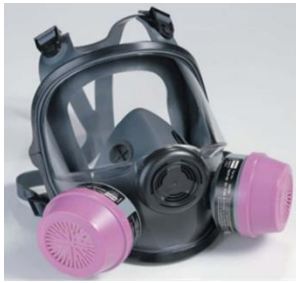
Full Face Respirator