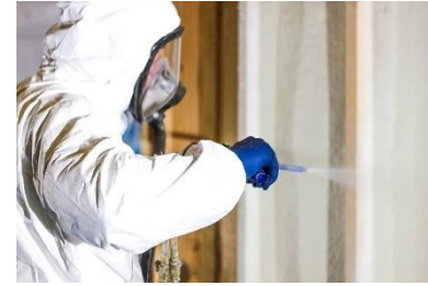
(6) Reusable Moon Suit XL