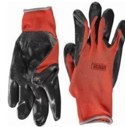
Case: Nitrile coated work glove