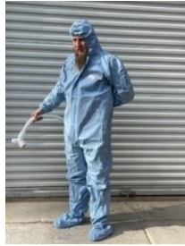
(2) SFG Branded Suits (w/ Tenn chillbox hookup) L/XXL